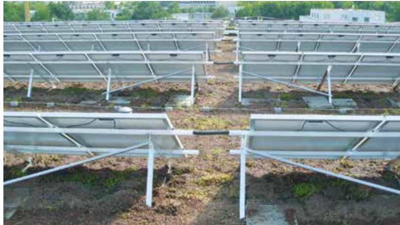
Tittmann Solar | State Theatre Stuttgart - Germany System: 112 kW | Triangle System