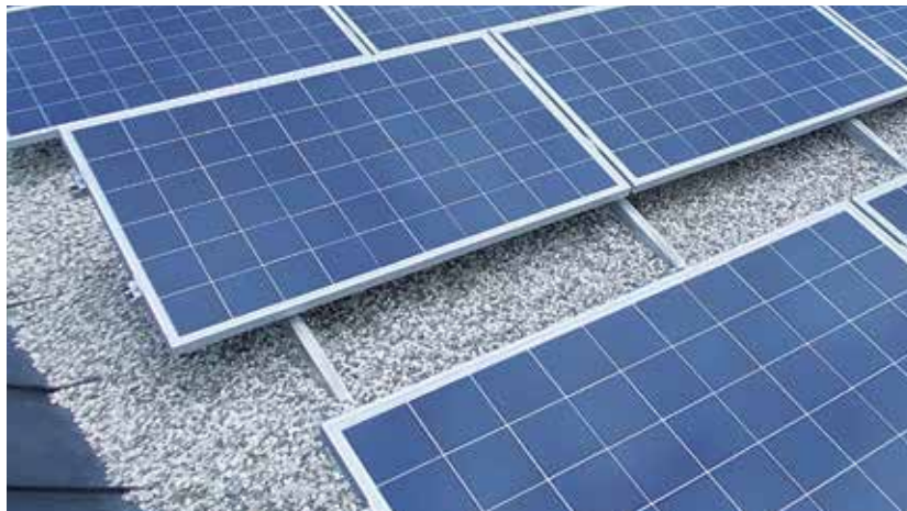
Elpo | Seis - Italy System: 5.76 kW | Triangle System